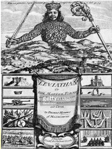
Graph 1: The emergence of Corona Leviathan, strategies and measures

The state strategies evoked by the virus threaten crucial relations in societies from micro-level of households, communes, cities, regions, nations to the worldwide arena. The model illustrates how the Corona-Leviathan evolves to a game of a self-reinforcing system. Thereby, the biological and virological data are used to create and diffuse the imageries of a pandemic between anxiety, uncertainty in majorities opposed by minorities.